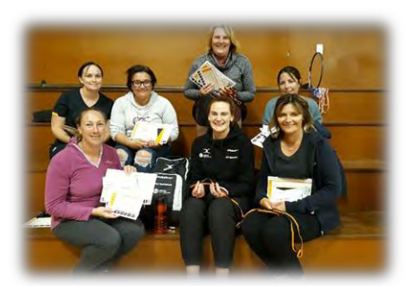
NSDWU Workshop Hokitika