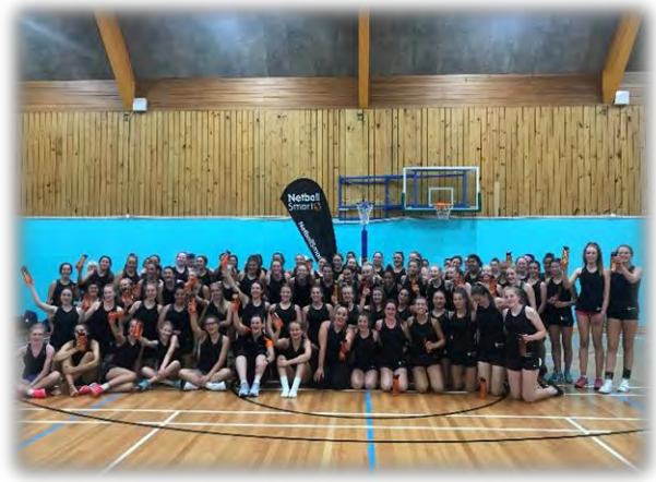
Christchurch Netball Centre, Summer Development Camp