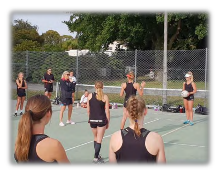
Christchurch Netball Centre, Summer Development Camp

The NM team has been working with some Centres to support their PDP sessions. These sessions provide an excellent learning opportunity for coaches, coaching alongside or observing other coaches, with the support of a coach developer. The Muffin Break Year 7&8 PDP delivered at 10 Centres provided a quality learning opportunity, not only for players but also for coaches and umpires.