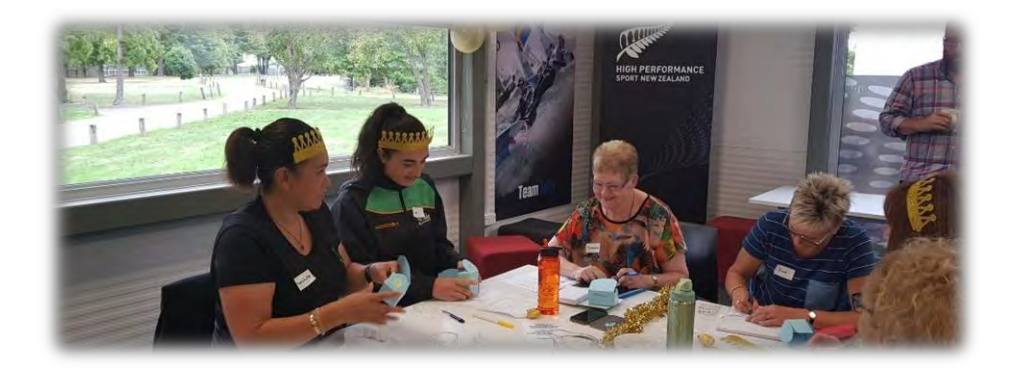
Coach Developers & Umpire Coach Developers – The Gold Nuggets of Facilitation

The second training day was attended by a smaller group of coach developers and the focus was on the wider role of coach developers in our Zone, not only facilitation of workshops. Our senior coach developers have been supporting of some of the new coach developers in their training by doing co- delivery of workshops and peer observations.