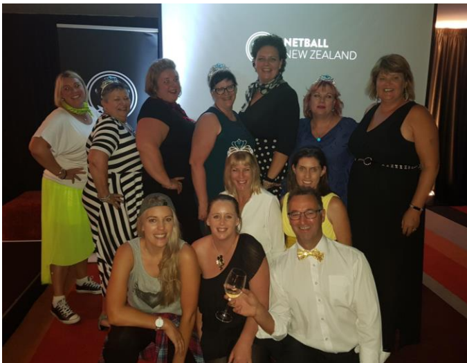
Representing Mainland with pride at the NNZ Council Meeting