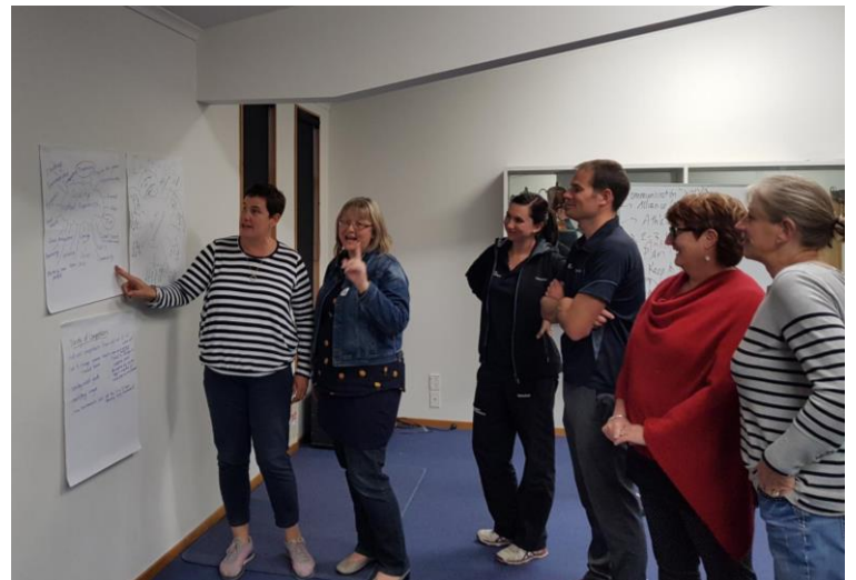
South Canterbury hosting key Netball leaders from their secondary schools to plan for quality athlete development