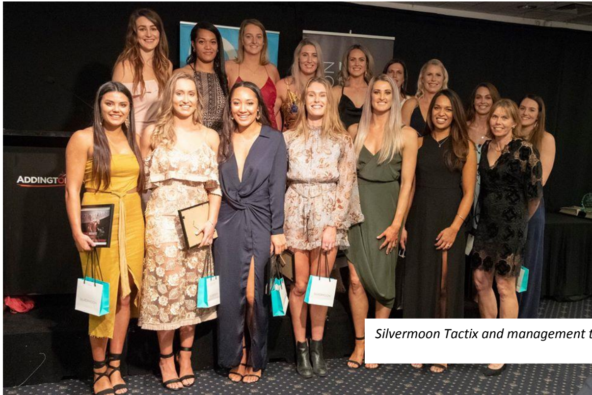
Silvermoon Tactix and management team