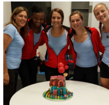
Tactix team showing off their cake decorating skills at the Team day