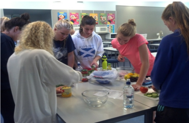
ET squad members preparing their Saturday evening dinner during the "ET Master Chef Challenge"