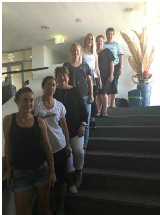
Netball Mainland's Coach Developer staff attend NNZ Community Forum