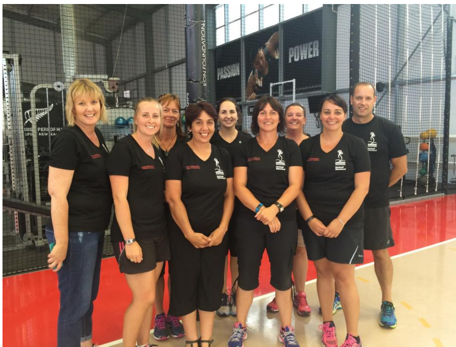
Coaches from the Netball Mainland's Performance Coach Squad