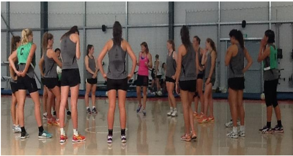
Court session at the March workshop.